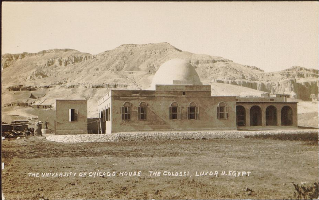
THE UNIVERSITY OF CHICAGO HOUSE THE COLLOSI, LUXOR U. EGYPT